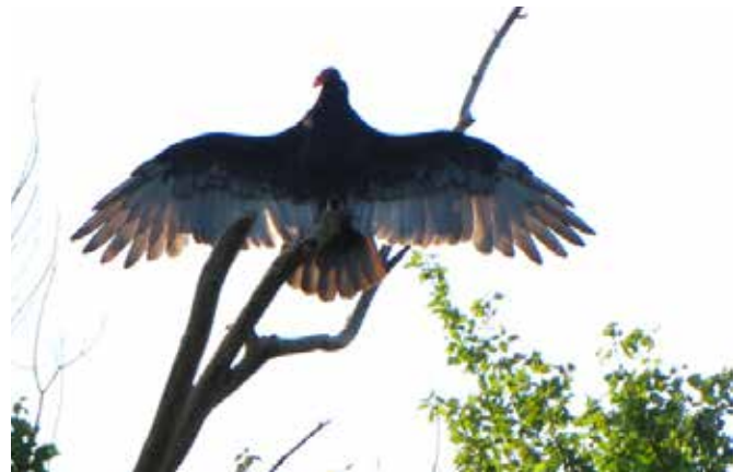
Above left, a black vulture keeping watch on a nesting tree. Above, soaring black vulture seen from below. Below, turkey vulture drying its wings.