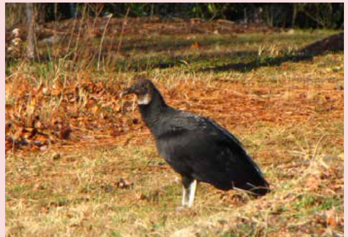
(Clockwise) A hollow tree used by nesting black vultures , the ground nest within the hollow tree and a black vulture standing watch.